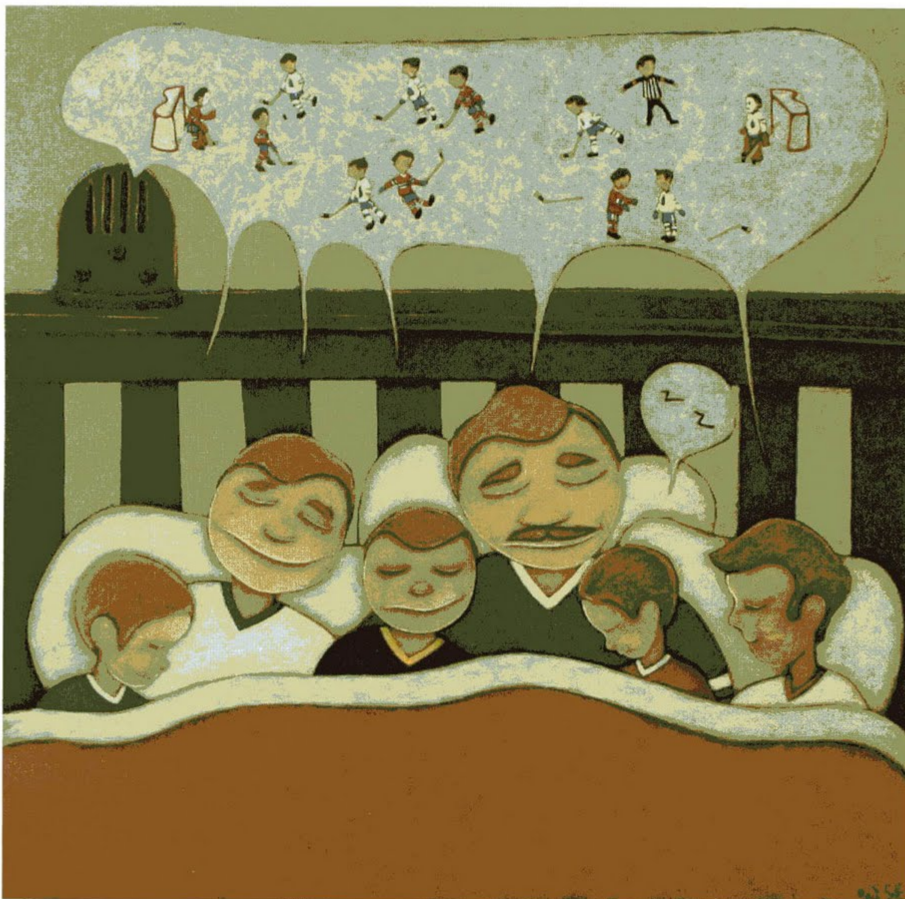
Watching the Game on the Back of our Eyelids , acrylic, 48 x 48 in.