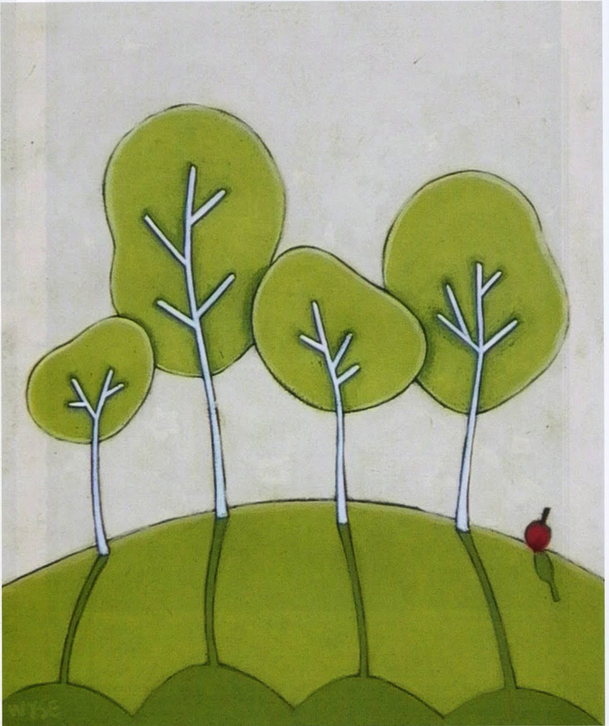
The Family Tree , acrylic, 12 x 10 in.