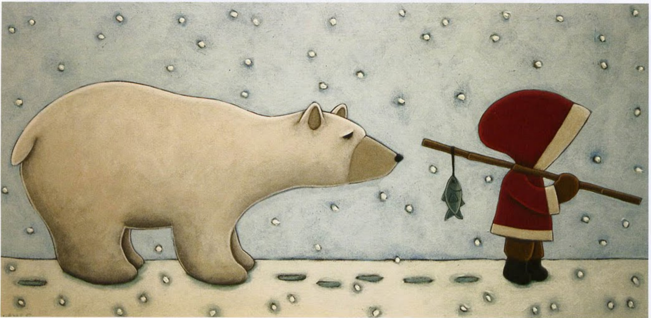
Of the North , acrylic, 12 x 24 in. White Rock Galleries, White Rock, BC.

history of a painting emerge through all of the layers," he says.