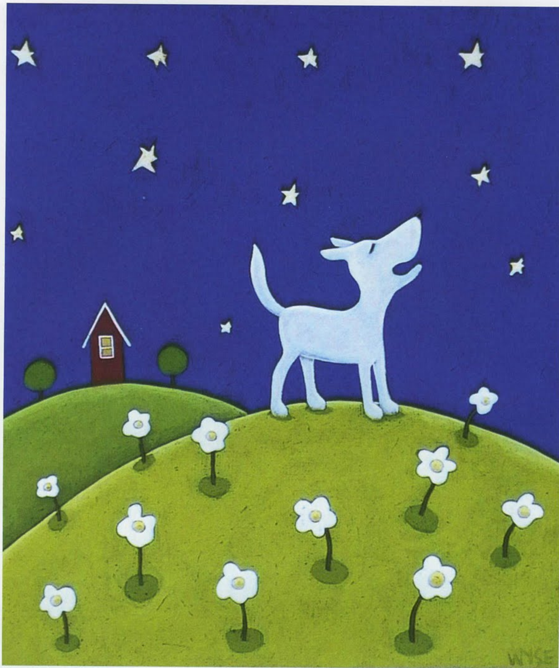
Midnight Serenade , acrylic, 14 x 12 in.

ther was a strong influence on his own career as a painter and can remember the moment when it all came together.