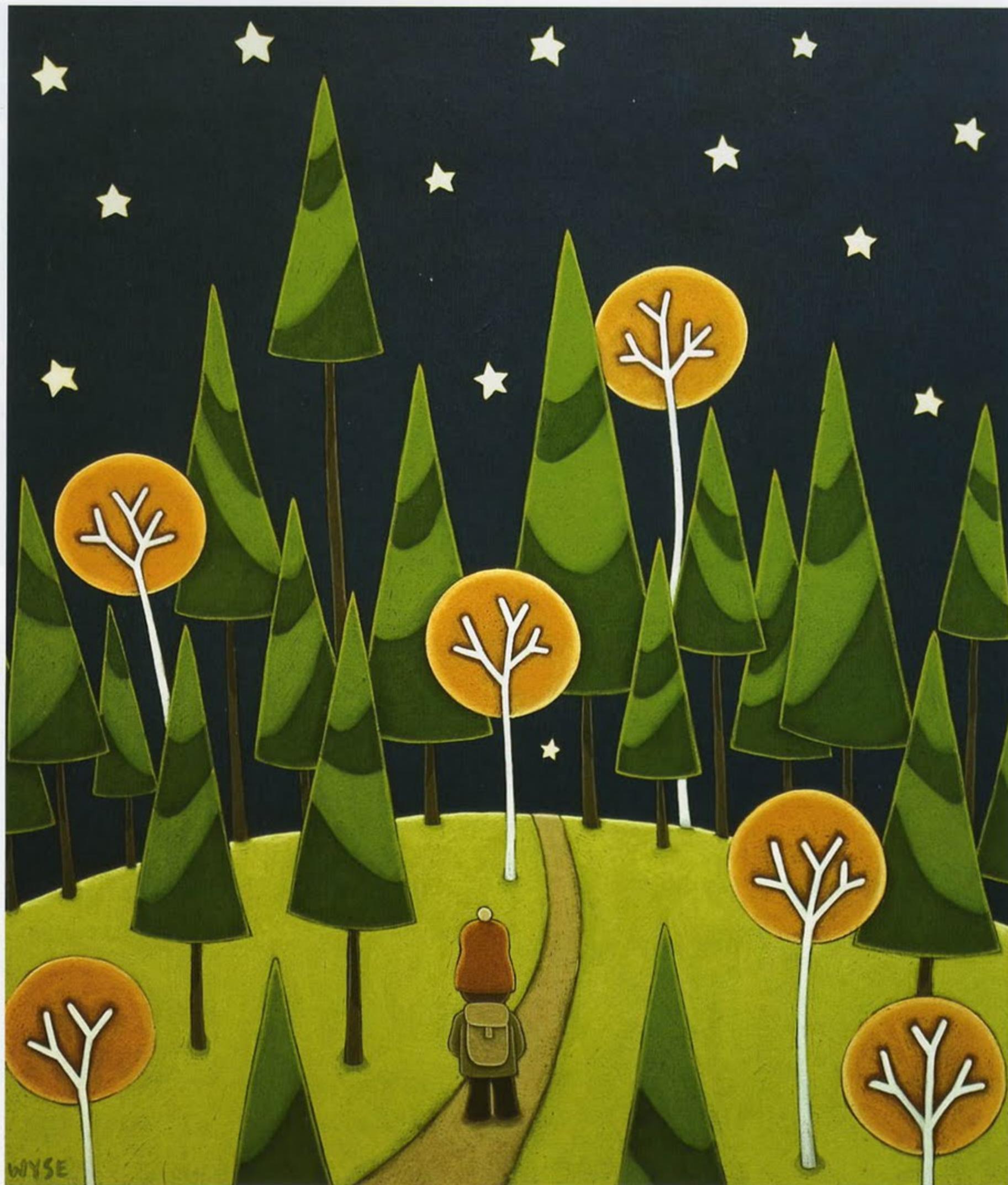
The Trail , acrylic, 24 x 20 in. White Rock Gallery, White Rock, BC.