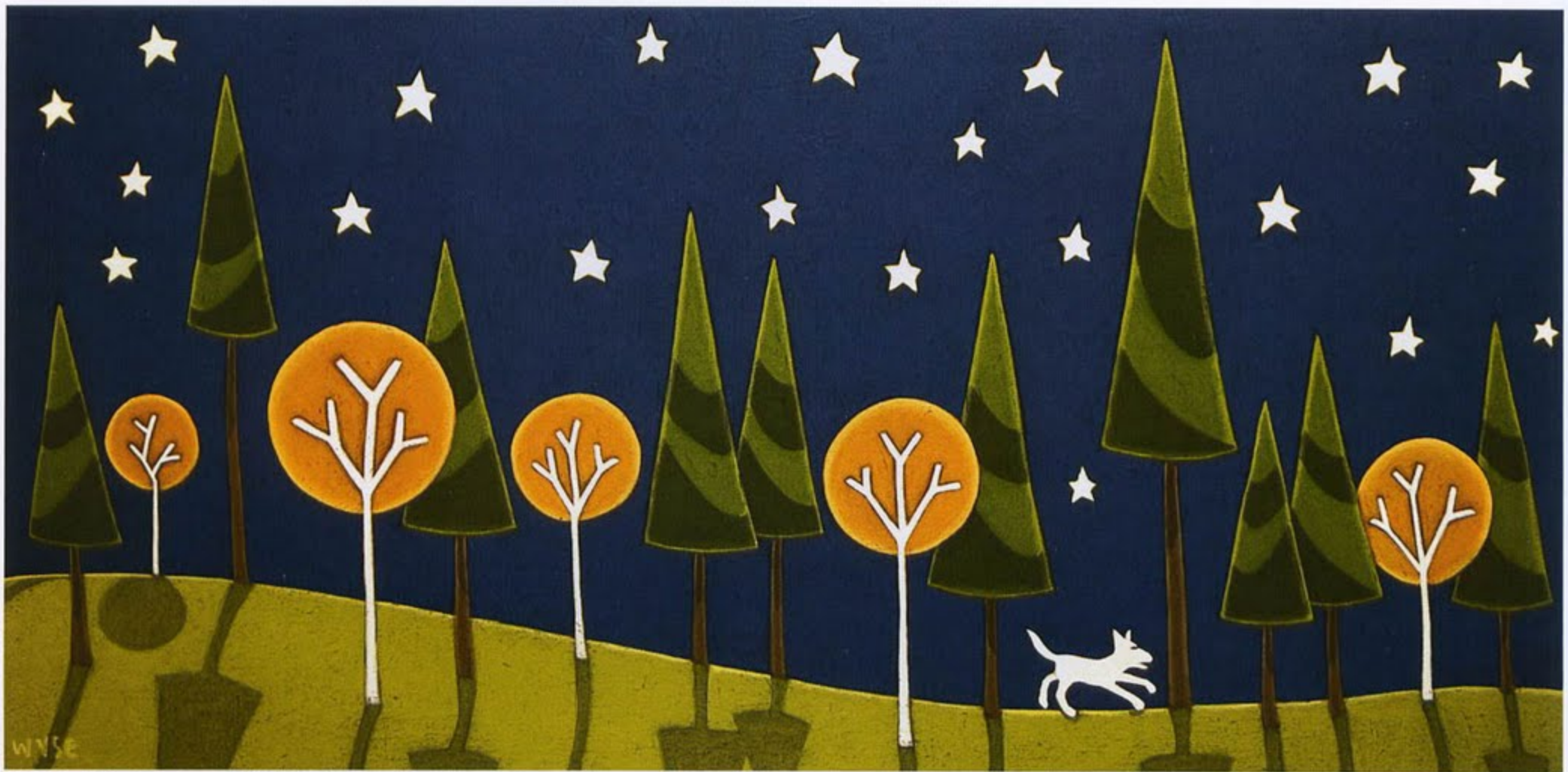
Shadow Racing , acrylic, 12 x 24 in. White Rock Gallery, White Rock, BC.